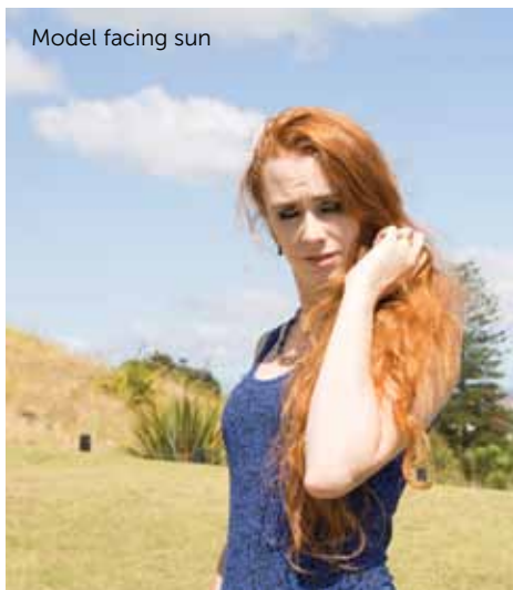
Model facing sun